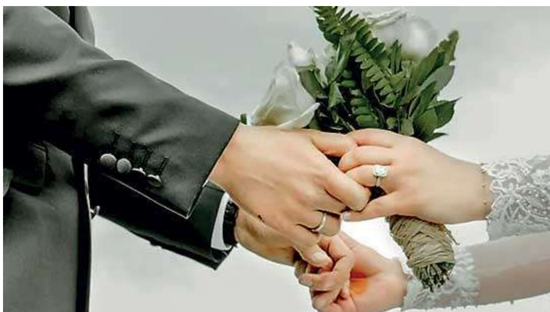
Newlywed Sri Lankans forced to remain childless