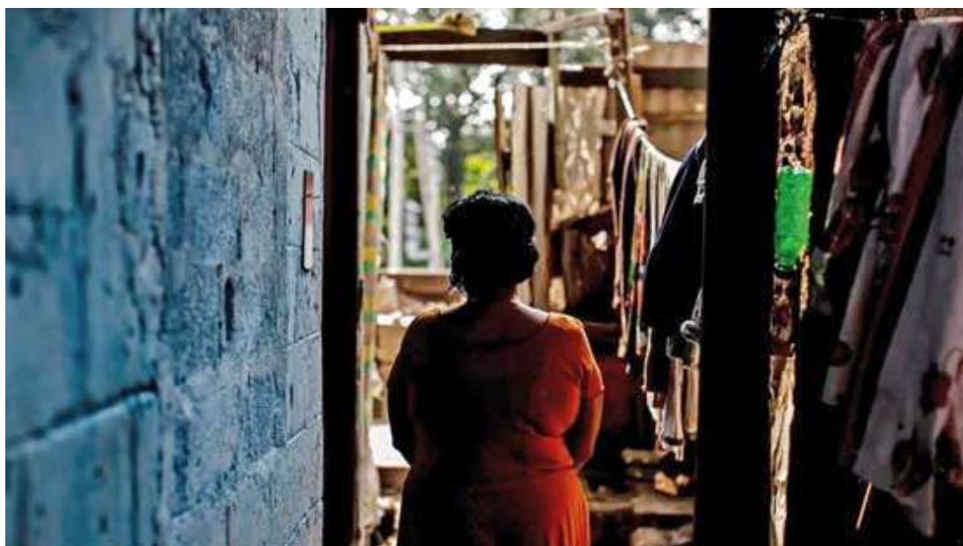
Research on sex work during Lankan civil war: Sex workers and their faint cries to access basic rights