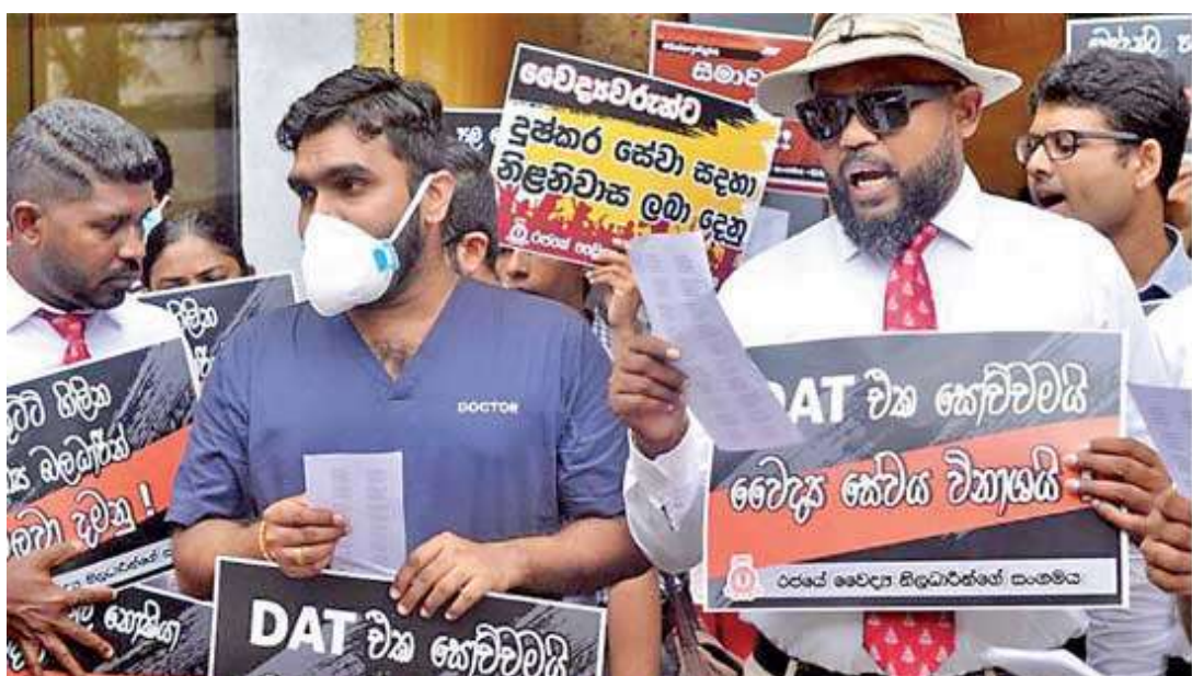
Paramedics and docs in tug of war over raise in DAT allowance