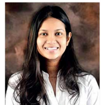
By Lakshila Wanigasinghe