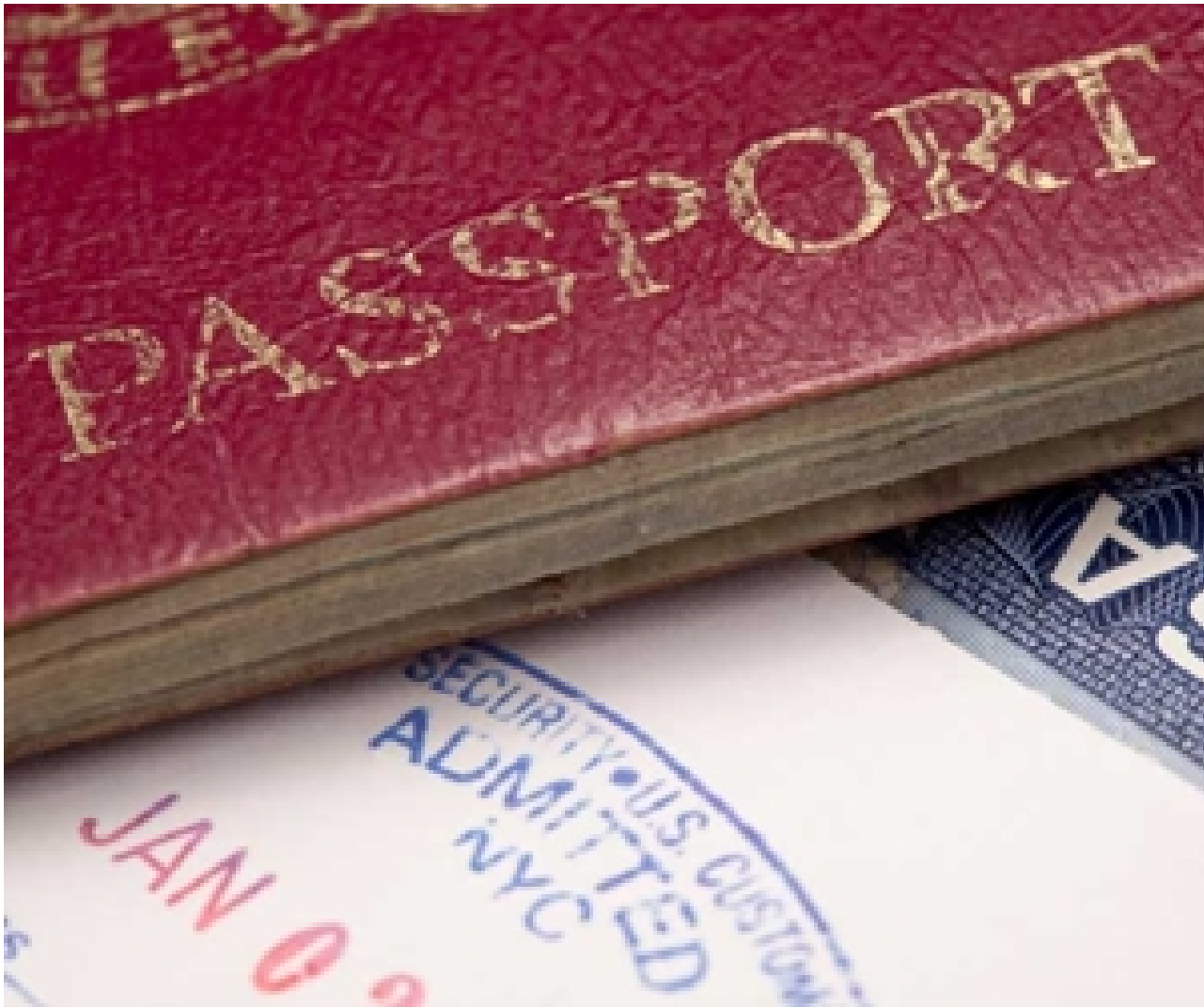
How Learning 11 Languages Taught Me 11 Crucial Lessons