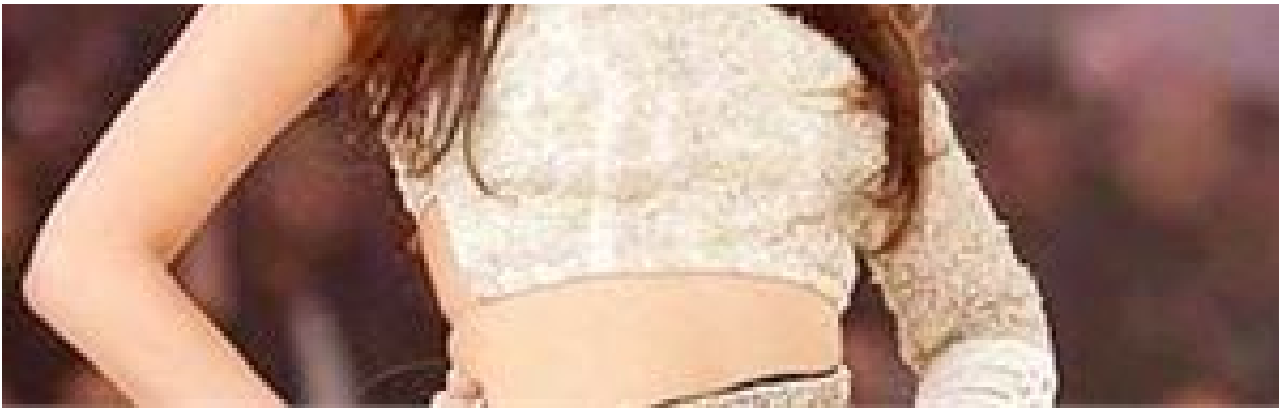
I've seen how Muslim girls beg for roles in Bollywood: Sabeeka Imam