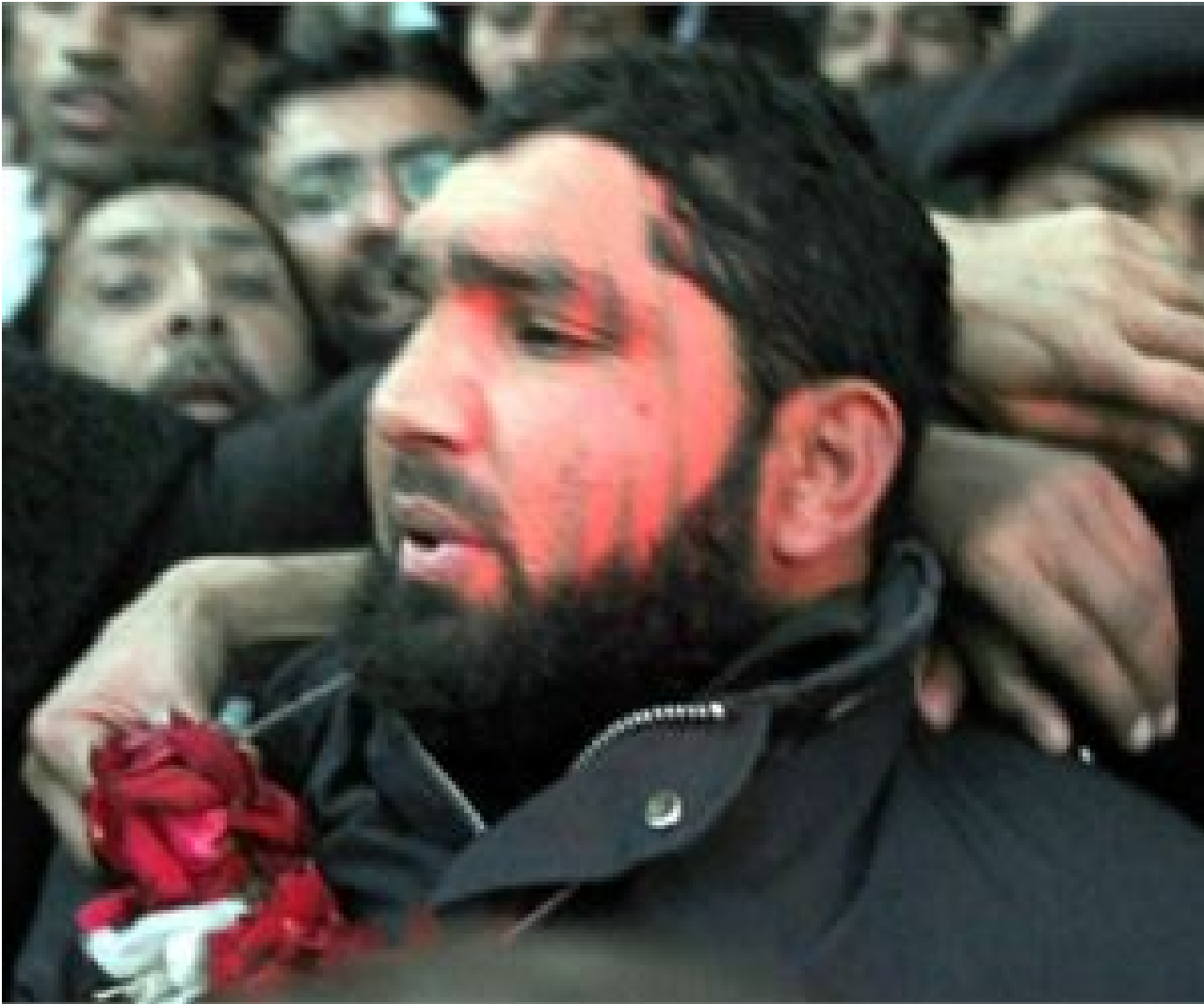
Clerics flex muscle 'for Qadri's release'