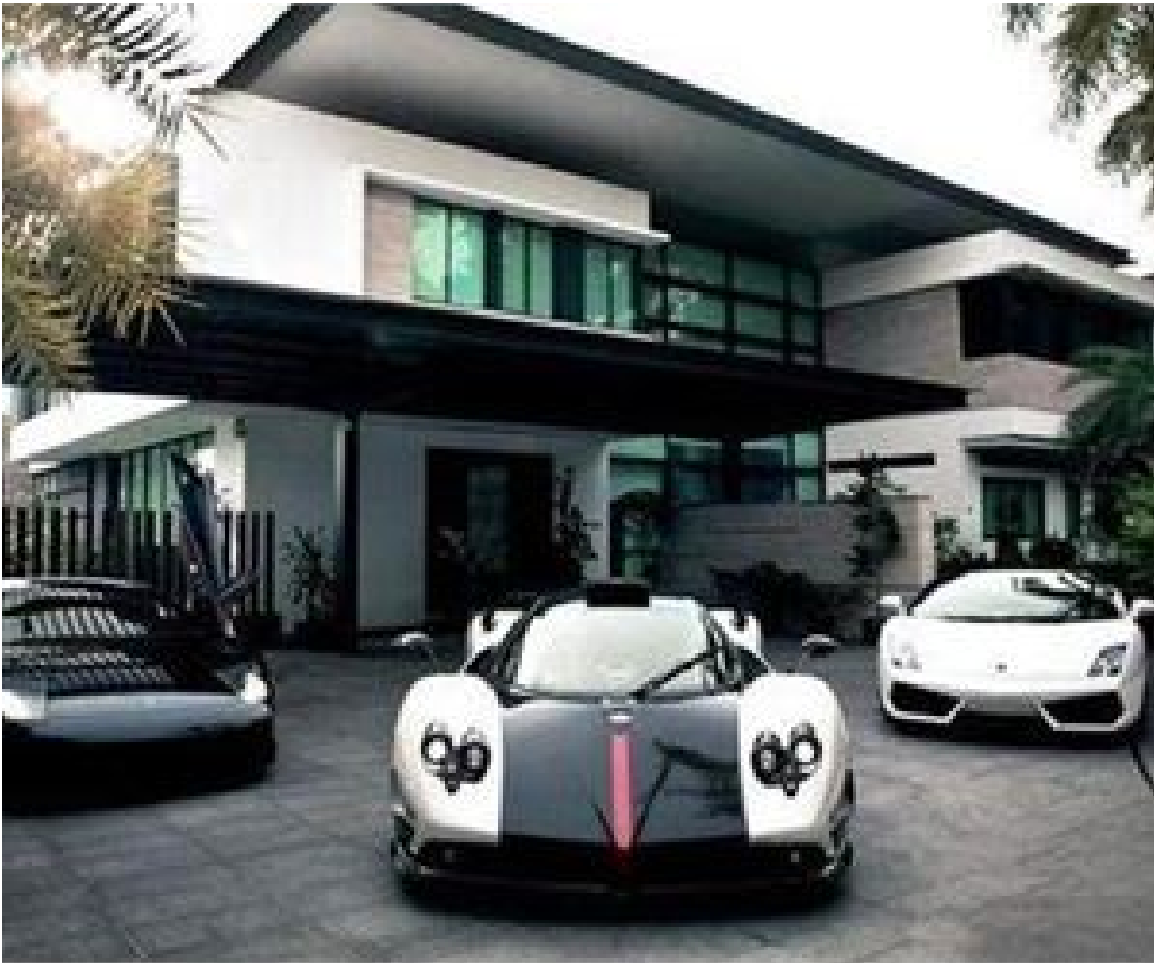
Wanna Live Like A Millionaire's Son?