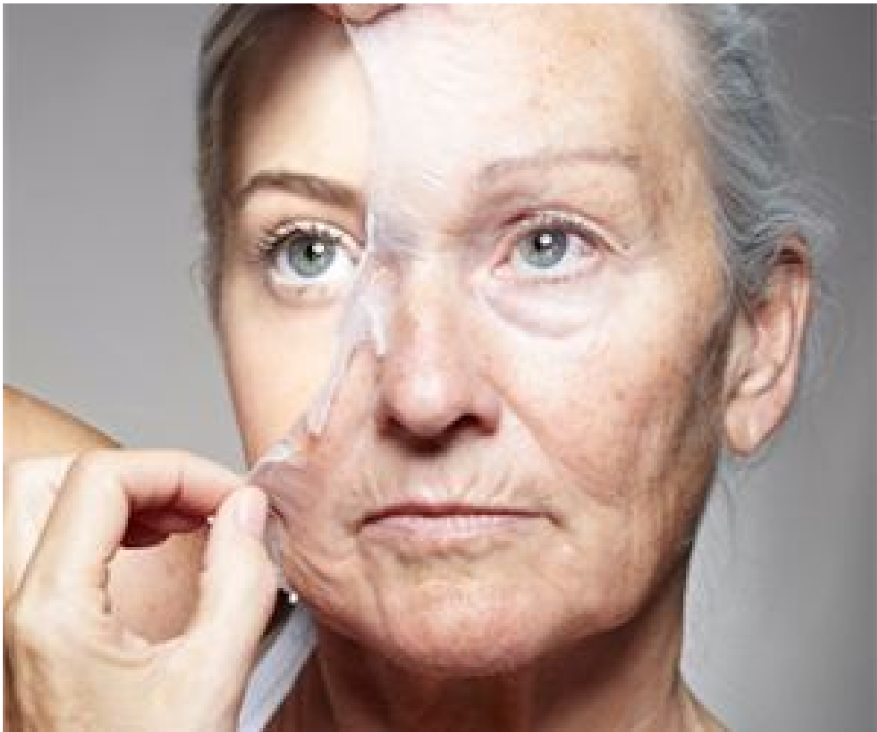
Granny Reveals Her Method: Don't Use Botox, Do This Instead