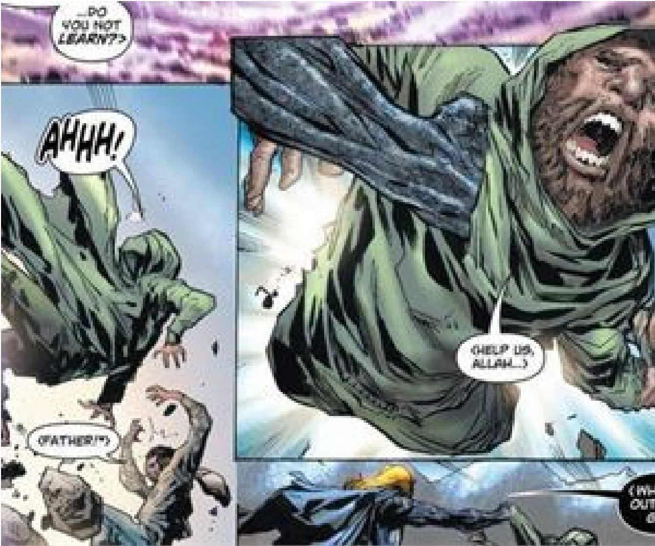
DC Comics gets trolled by speakers of 'Pakistanian' language