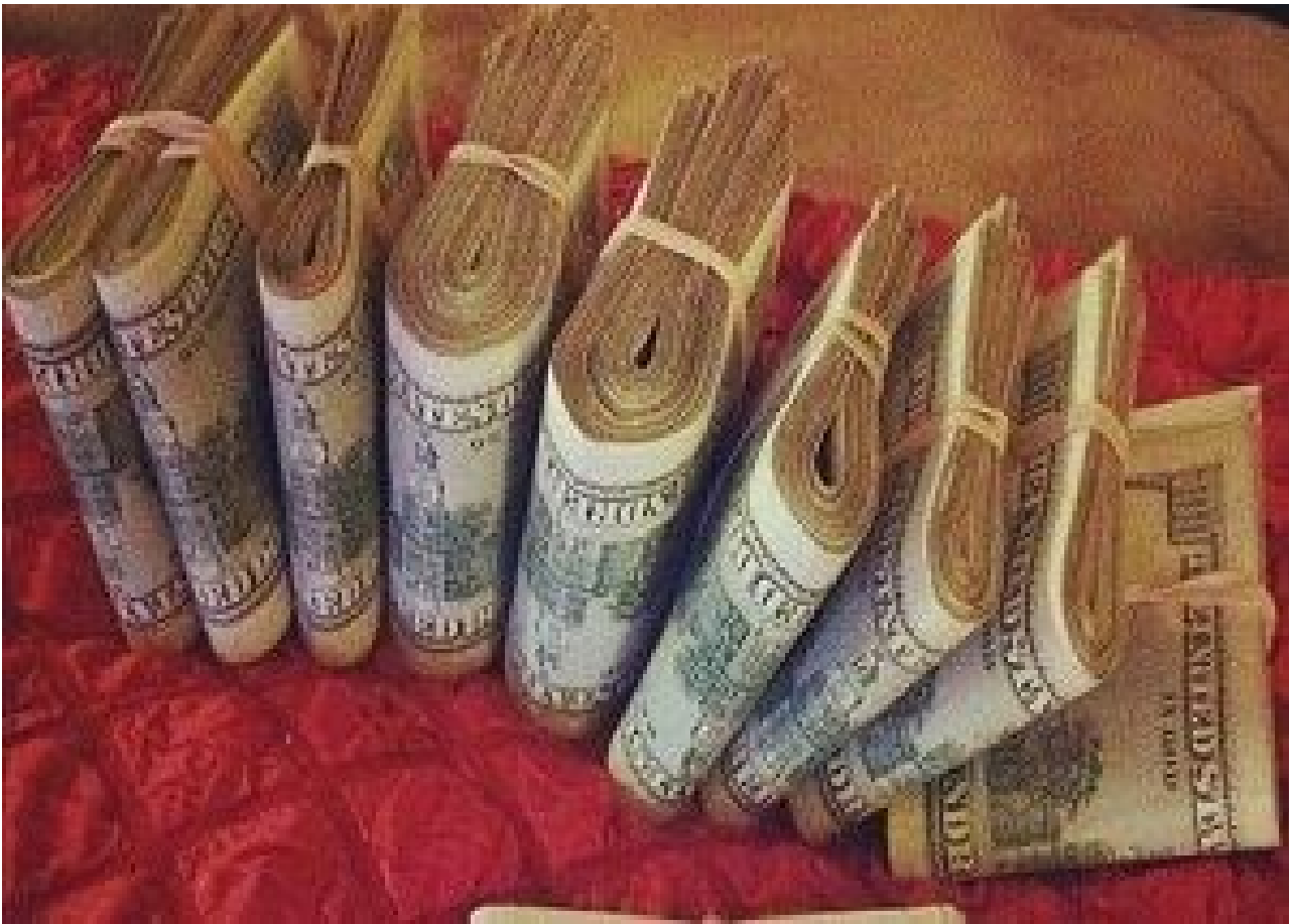
Start Making $600,000 Per Month